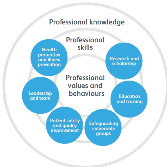
The nine domains of the GMC's Generic Professional Capabilities

Good medical practice (GMP) [11] is embedded at the heart of the GPC framework. In describing the principles, duties and responsibilities of doctors the GPC framework articulates GMP as a series of achievable educational outcomes to enable curriculum design and assessment.