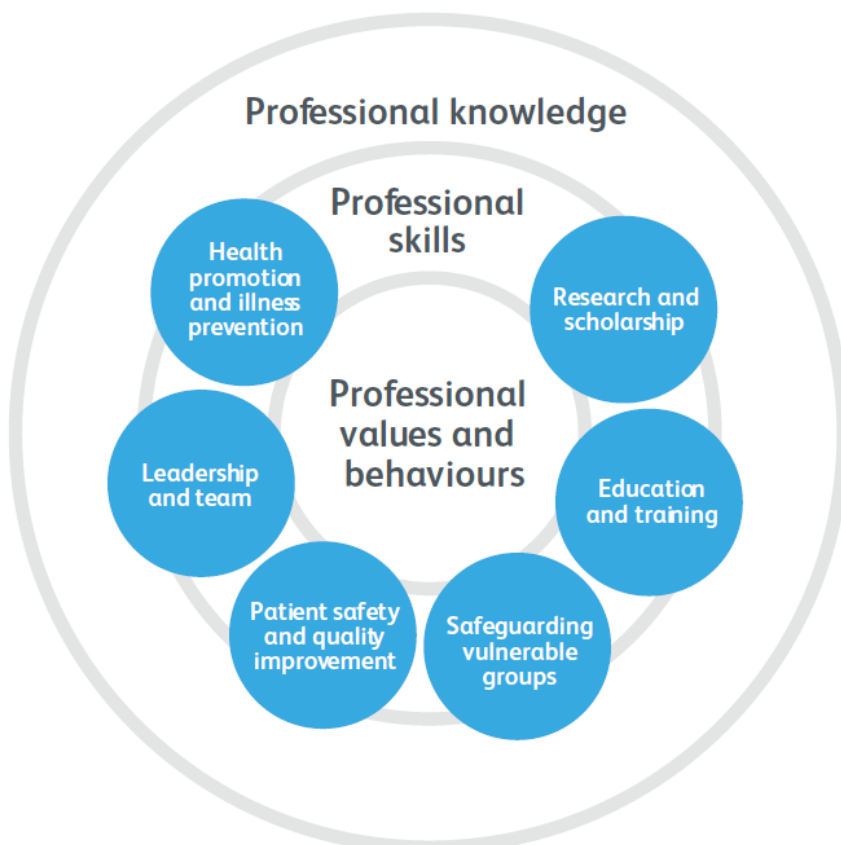
The nine domains of the GMC's Generic Professional Capabilities

Good medical practice (GMP) 10 is embedded at the heart of the GPC framework. In describing the principles, duties and responsibilities of doctors the GPC framework articulates GMP as a series of achievable educational outcomes to enable curriculum design and assessment.